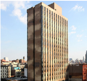
101 Ludlow Street, New York, NY

The School of Visual Arts is a multidisciplinary college of art and design known for its unparalleled faculty and innovative curriculum.