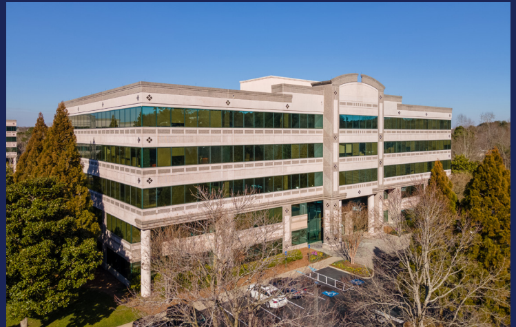
3700 Mansell Rd. - Mansell One