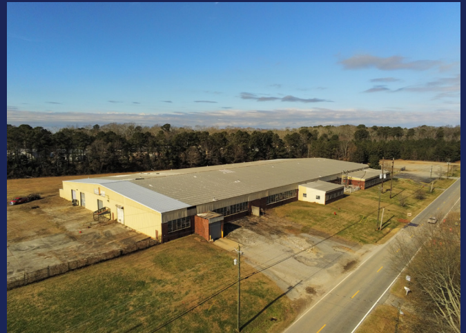
839 Everee Inn Rd.