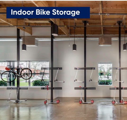
Indoor Bike Storage