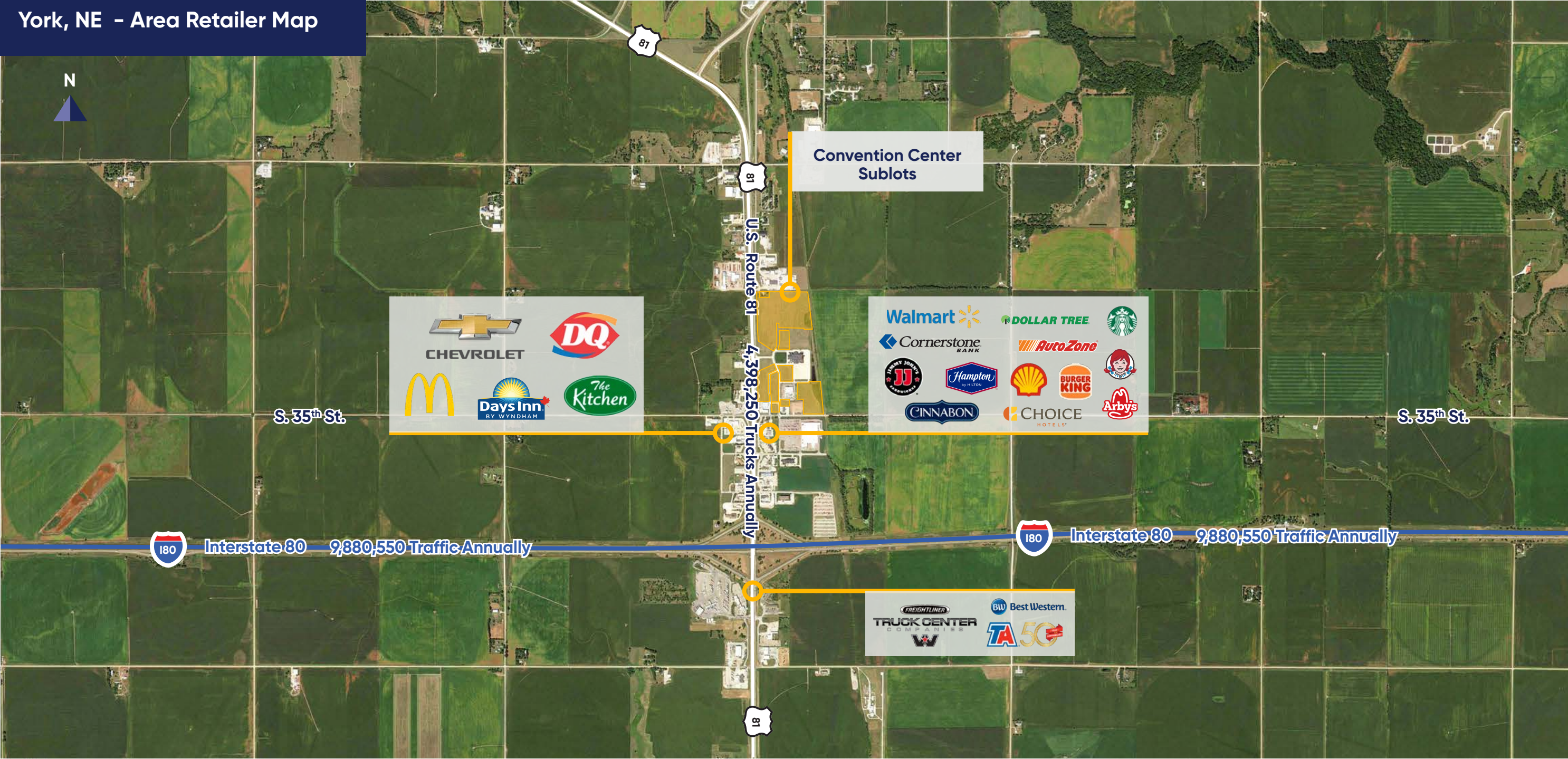
York, NE - Area Retailer Map