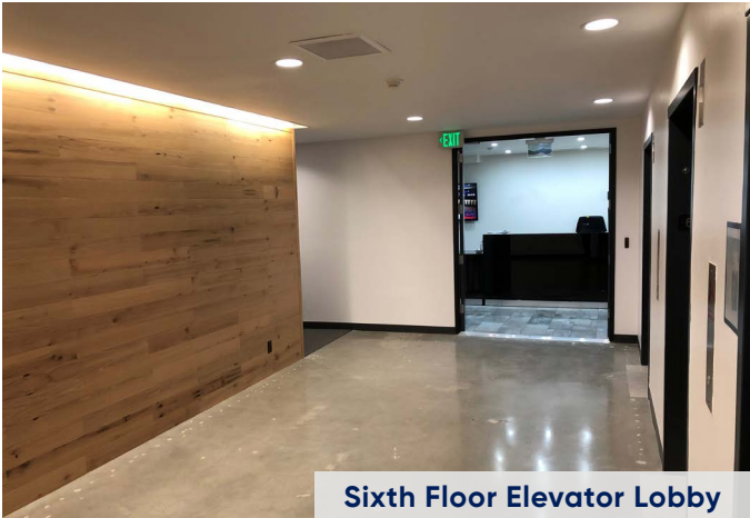
Sixth Floor Elevator Lobby