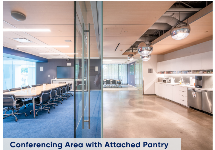
Conferring Area with Attached Pantry