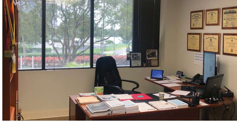
5805 Waterford 5805 Blue Lagoon Drive