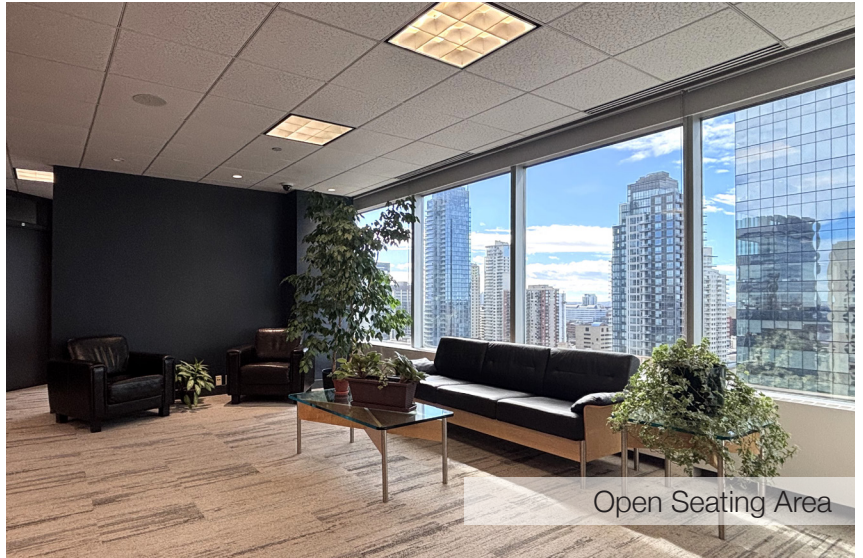
Open Seating Area