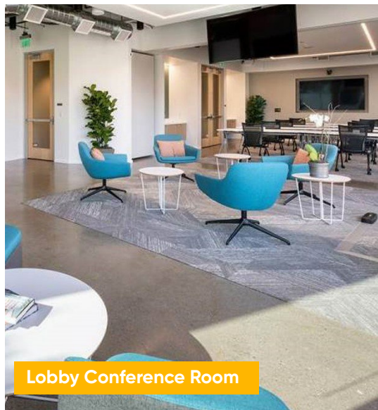
Lobby Conference Room