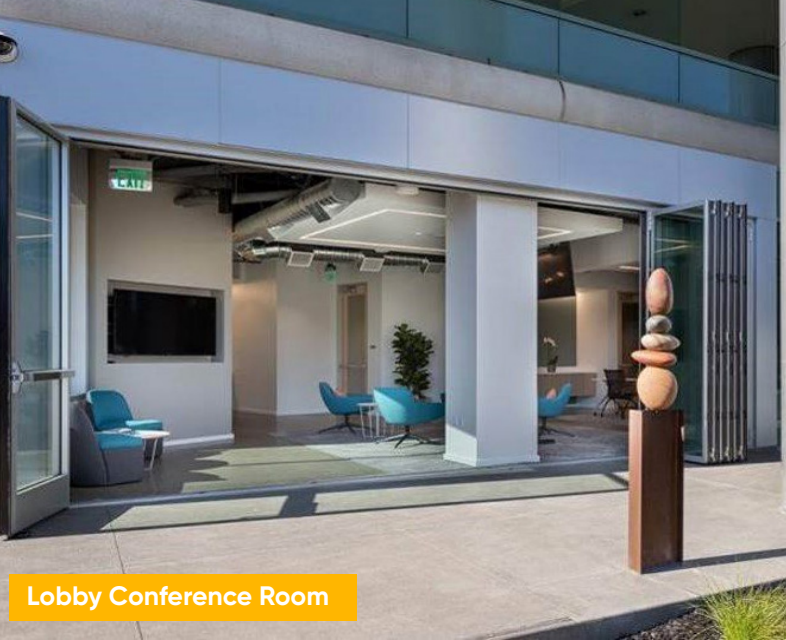
Lobby Conference Room