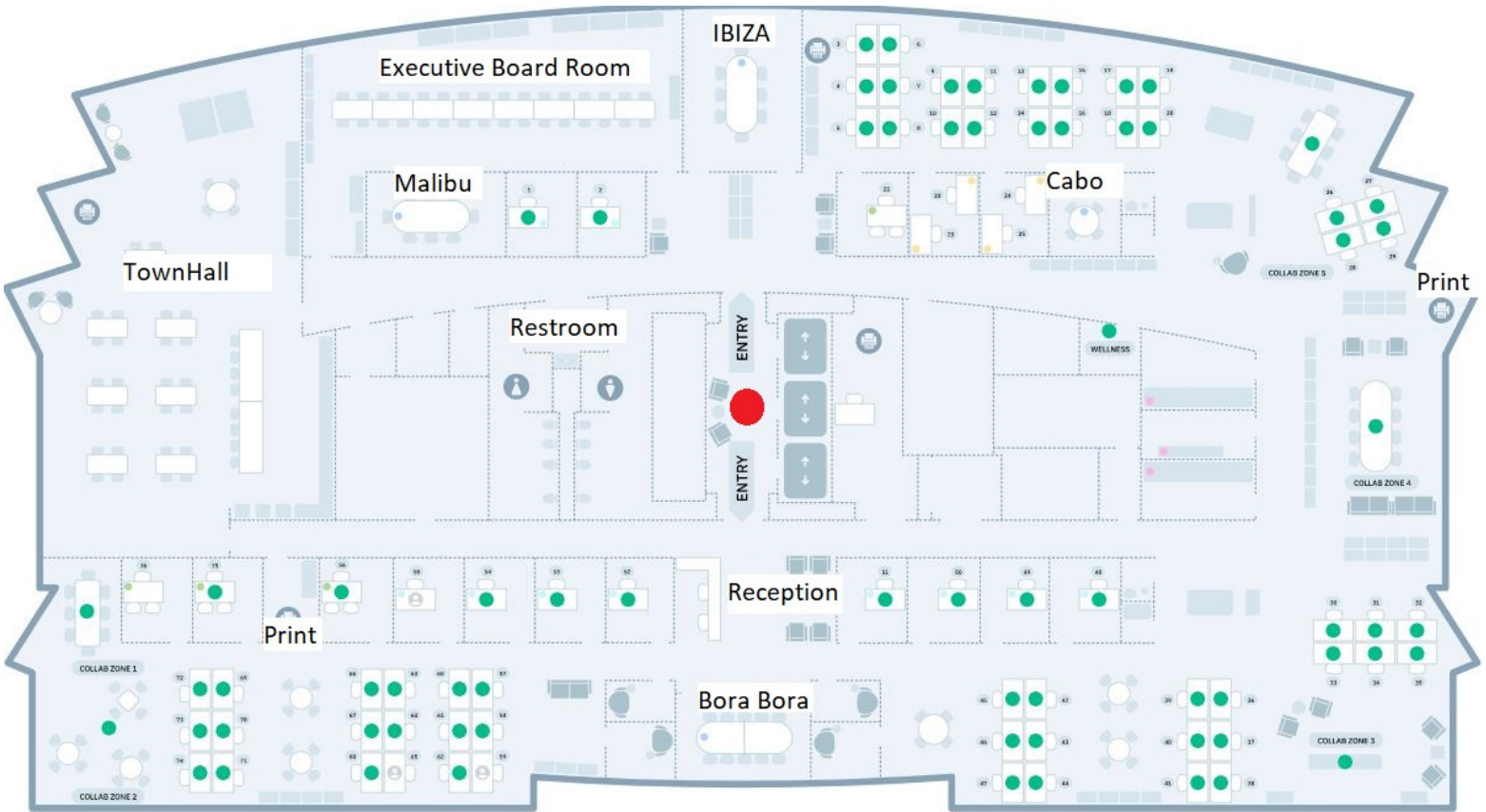
4th Floor Plan | 24,569 RSF