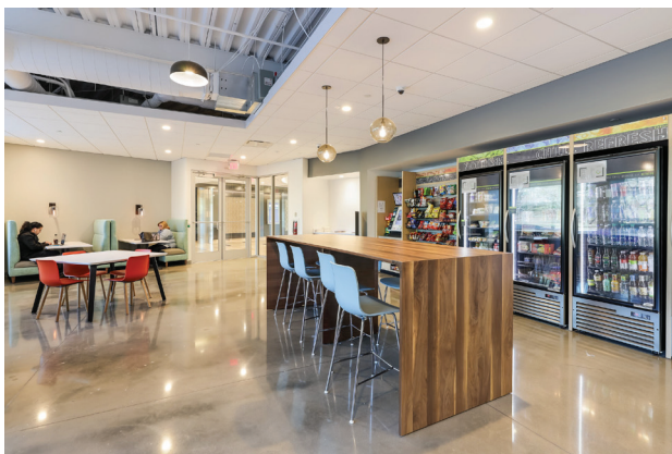
Tenant Lounge/Grab n Go