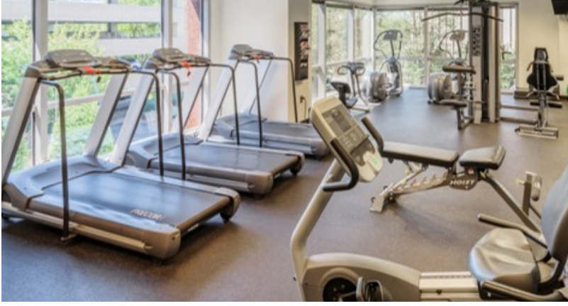
SouthPark Towers I 6100 Fairview Road | Charlotte, NC 28210