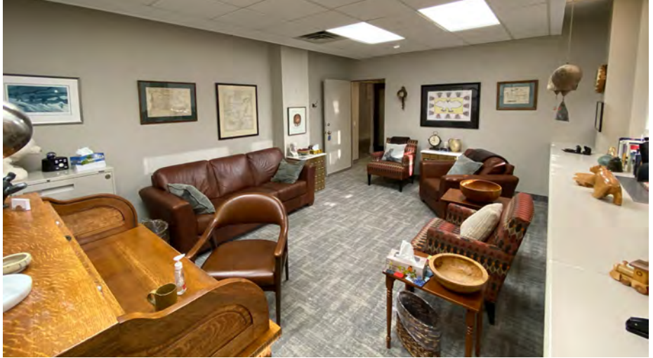
Bright office suite located in downtown character building

The space is ideally suited for a small start-up requiring a central downtown location. Conveniently situated on Stephen Avenue Mall, the Lancaster Building is located minutes from several amenities in the immediate area.