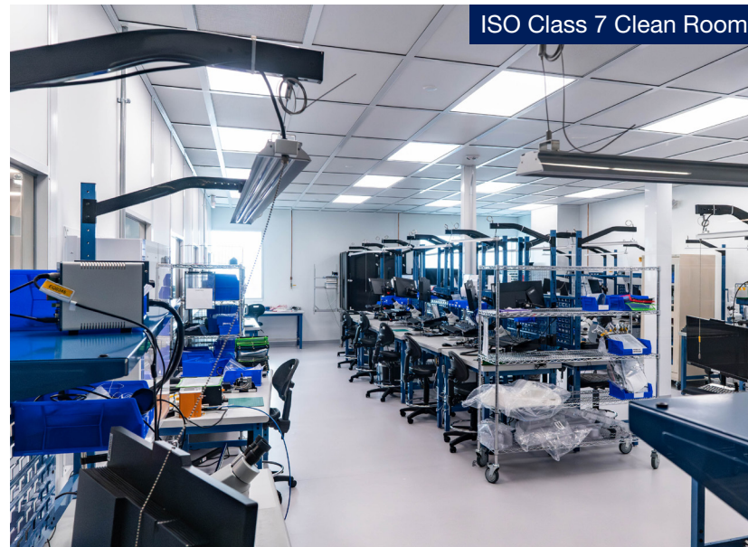
ISO Class 7 Clean Room