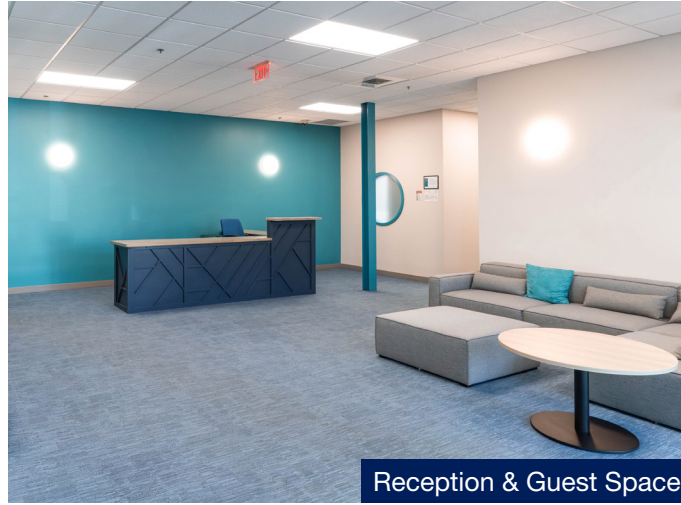
Reception & Guest Space