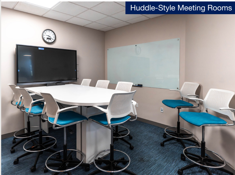
Huddle-Style Meeting Rooms