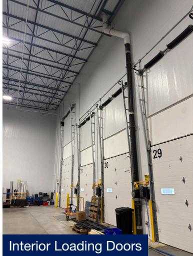
Interior Loading Doors