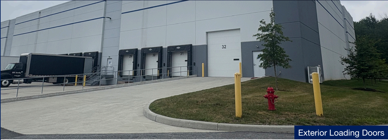
Exterior Loading Doors