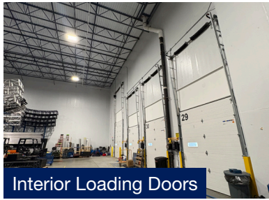
Interior Loading Doors