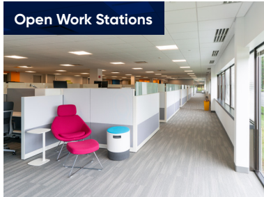
Open Work Stations