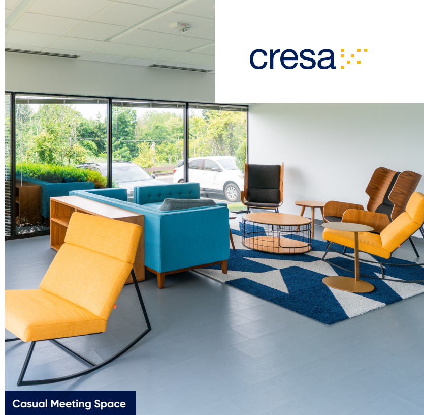
Casual Meeting Space