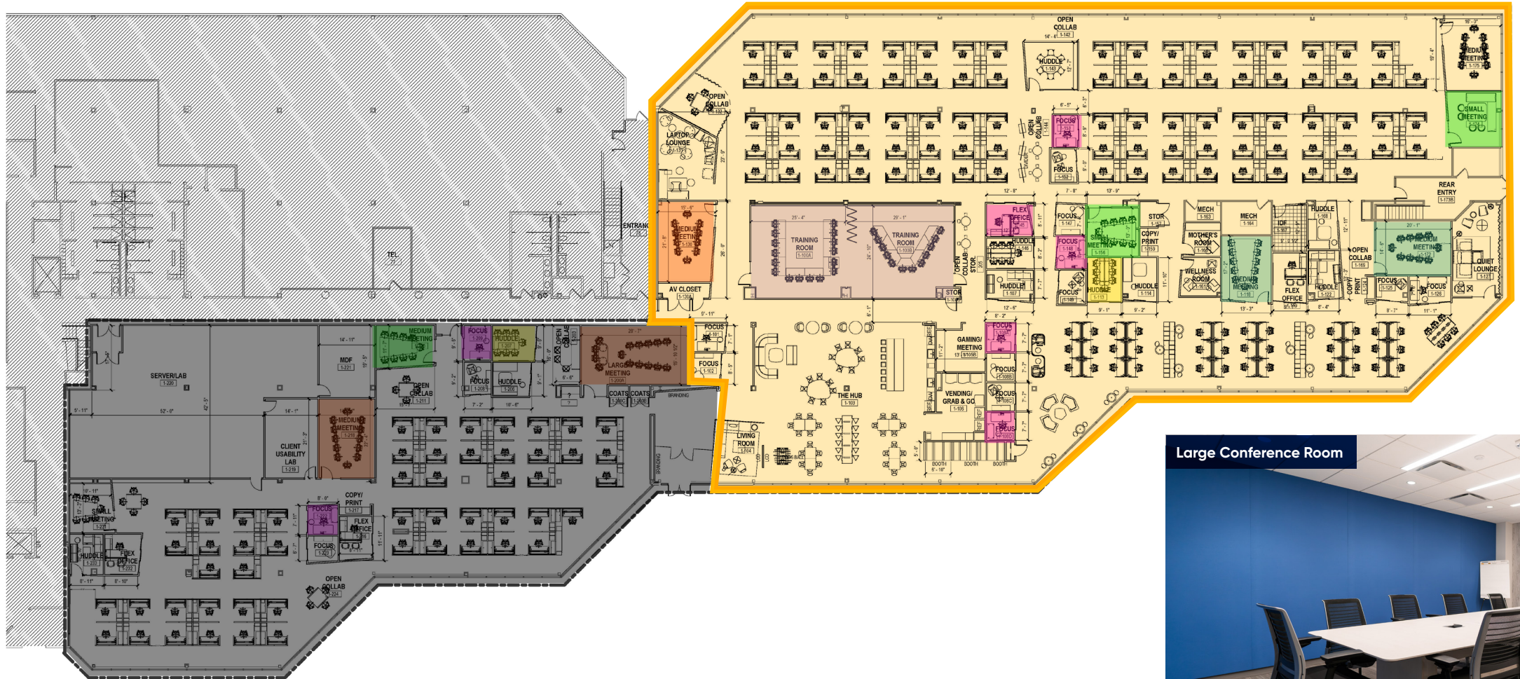
Large Conference Room