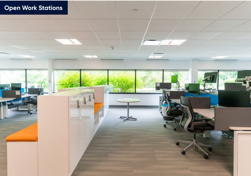
Open Work Stations