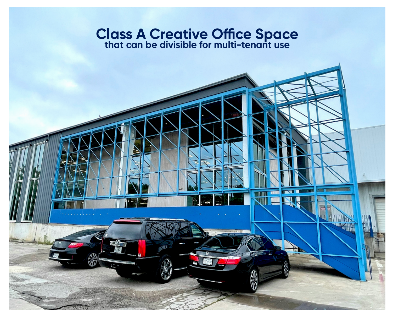
±1,500 - 14,500 SF Available Now